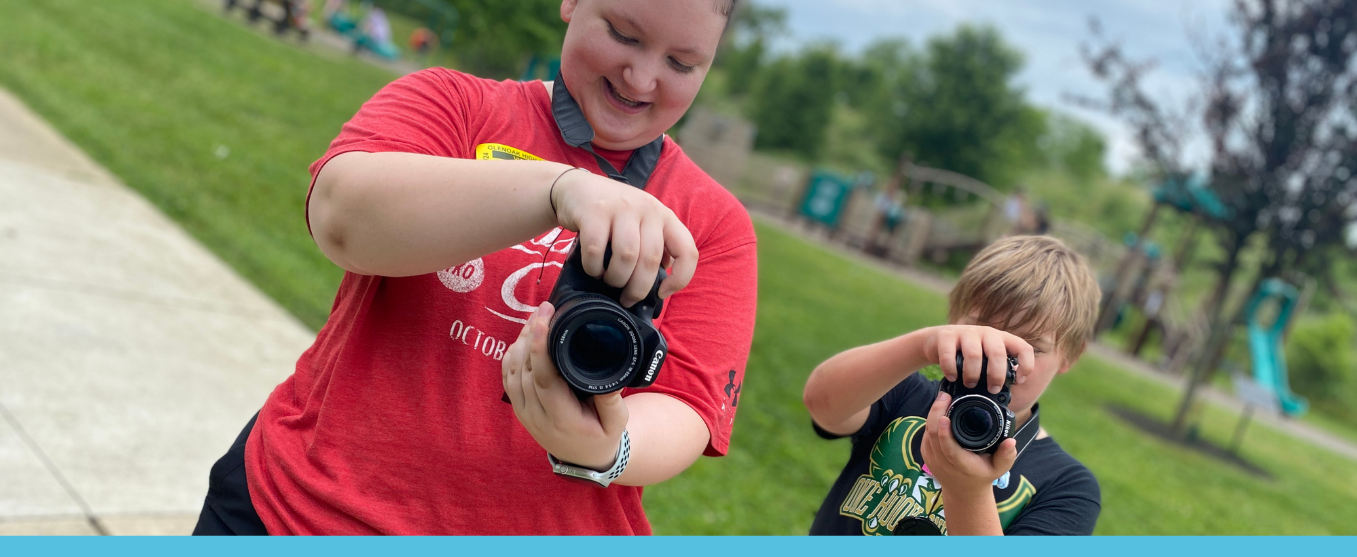
TomTod Ideas is a youth development nonprofit in NE Ohio that listens to, honors, and advocates for middle schoolers.

Yep. You read that right. Middle schoolers, and only middle schoolers.